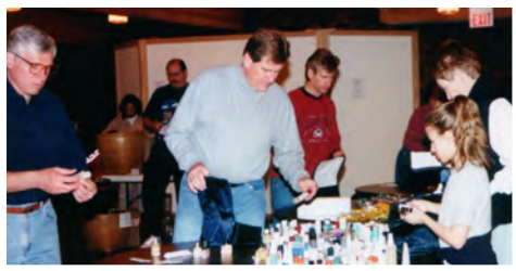
Small Church Community members are involved in numerous parish ministries as well as outreach projects born out of the faith sharing of their small communities.